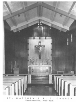
ST. MATTHEW'S R.C. CHURCH Voorheesville, New York