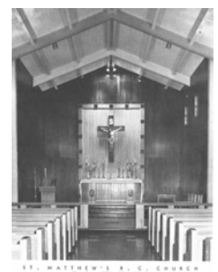
ST. MATTHEW'S C.C. CHURCH Voorheesville, New York